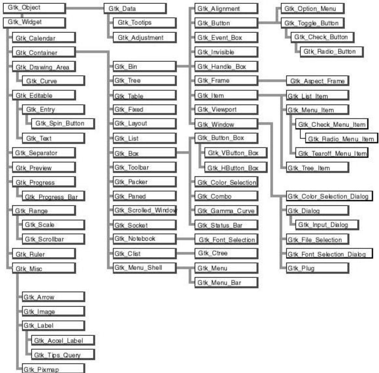
Figure 2.1: Widgets Hierarchy