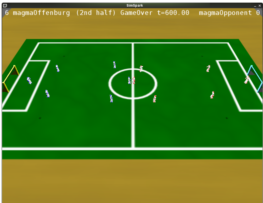
Figure 7.1: A screen shot of the soccer simulation with 6 vs 6 robots